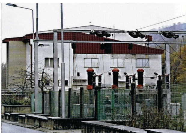
Fig. 2. HE “Vrla 2”, village Bitvrđa, 1954 [5]

HPP “Vrla 2” is located 7 km from Surdulica near the village Bitvrđa. The HPP “Vrla 1” uses water that passes through the HPP “Vrla 1” and the waters of the rivers Vrla, Bitvrđa and Gradski Potok. HPP “Vrla 2” uses the total water drop between elevation 868 m and 710 m, or 158 m. HPP “Vrla 2” was installed in September, 1954. HPP “Vrla 2” starts with an accumulation basin with a volume of 100 000 m 3 of water, just below the outlet waters of HPP “Vrla 1”. The accumulation pool was constructed by building a dam over 23 m high and 80.5 m long. The dam is on a rocky ground, with an injected bottom of up to 15 m. The body of the dam is homogeneous, made of slate from the gallery of HPP “Vrla 1” which are firmly packed in layers of 50 cm. On the upstream side is a concrete wall with a reinforced, waterproof screen. Water is brought to the machine building which is above ground, through a tunnel 3568 m long, with a flow of 18 m 3 /s.