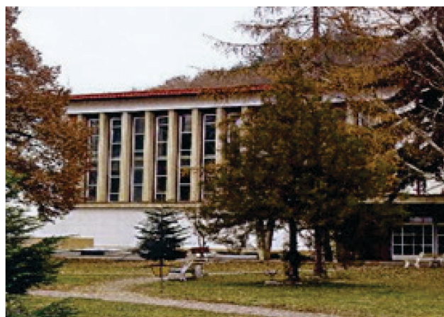
Fig. 3. HPP “Vrla 3”, village Masurica, 1955 [5]

HPP “Vrla 3” is located 2 km from Surdulica near the village Masurica. HPP “Vrla 3” has a gross water drop between