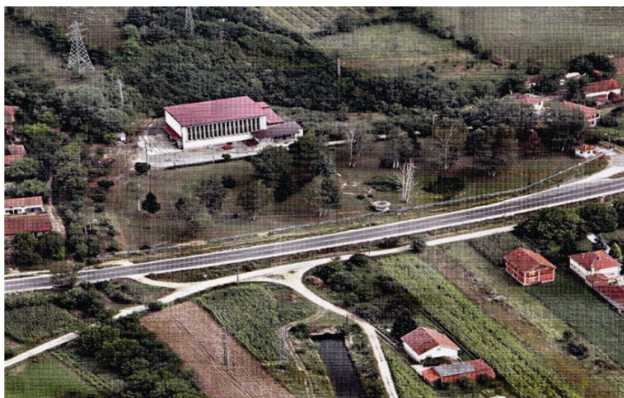
Fig. 4. HPP “Vrla 4”, village Polom near Vladičin Han, 1955 [6]

HPP “Vrla 4” is located 15 km from Surdulica along the highway in the village of