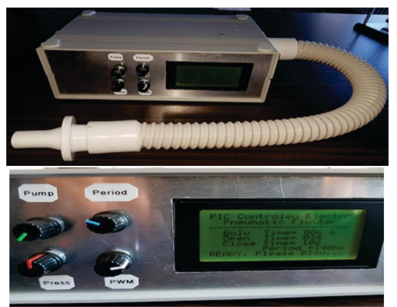
Fig. 3. External appearance of the device