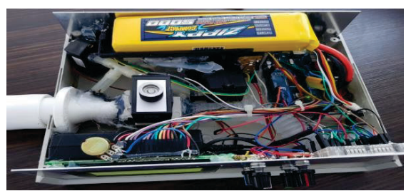
Fig. 4. Internal appearance of the device

In the designed device, a high-precision and sensitive analog pressure transducer is used to adjust the blowing pressure to the desired value via associated the potentiometer (5). A single-piston, suctionvalve-type mini compressor blowing powered by a 24V DC motor is employed to deliver positive pressure to the patient. The compressor's motor speed is controlled associated using the potentiometer, allowing for precise adjustment of airflow. During exhalation, the lungs are made to vibrate (oscillate) by the appropriate periodic opening and closing of a 12V electro-pneumatic valve with three paths and two positions. By modifying the valve's period with working the related potentiometer, the alveoli in the lungs can resonated. facilitating the be easier expulsion of accumulated secretions. Additionally, by using another adjustment potentiometer while maintaining the related opening and closing frequency, the durations of the valve can be altered through pulse-width modulation (PWM), thereby increasing or decreasing the expiratory resistance. This will contribute to both oxygenation and strengthening the