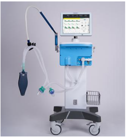
Fig 1. A Sample Ventilatör Machine

If we simply define ventilation, we can say that it is the movement of oxygen into and out of the lung. The main purpose of ventilation is to take the rich oxygen in the air into the lungs and to expel it in the air containing carbon dioxide in the lung. An example ventilator is shown in the figure 1.